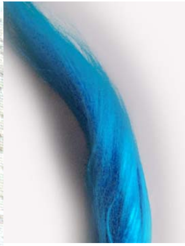
Tussah Silk #624 Turquoise