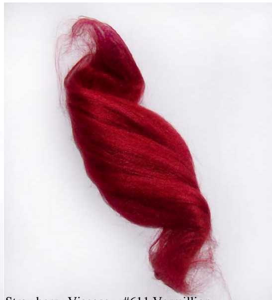
Strawberry Viscose—#611 Vermillion