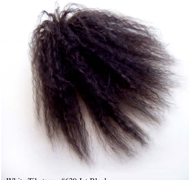
White Tibetan - #639 Jet Black