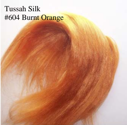
Tussah Silk #604 Burnt Orange