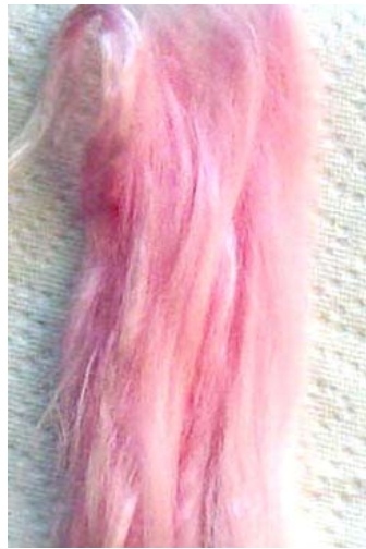
Viscose #608 Pink